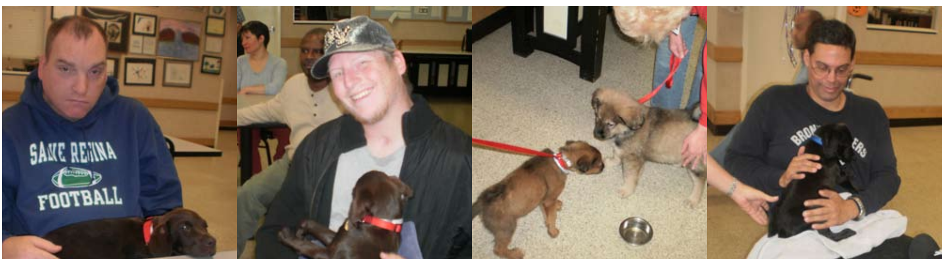
TBI Survivors enjoy some “puppy love” courtesy of the North Shore Animal League.

Unconditional Love...Pet Therapy. The introduction of animals into the patients’ environment is a way of humanizing health care. Research shows that pet therapy reduces emotional and physical pain; it also helps to diminish boredom and anxiety while creating a gentle and safe environment. When a pet is in the environment, the environment becomes less stressful and more nurturing. Community programs that bring animals and people together for companionship and therapy are rapidly growing. Here, at the Head Injury Association, we are involved with North-Shore Animal League, Bide-a-Wee and Dog Therapy Institute.