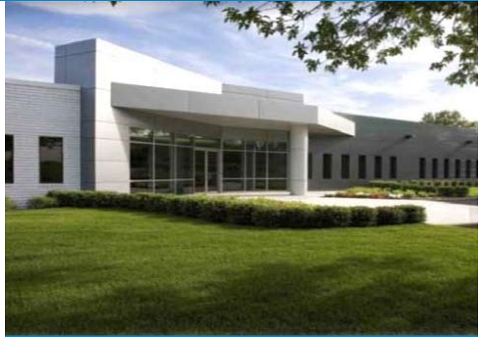
Head Injury Association Finds a New Home

We look forward, with great enthusiasm, to relocating to our new home!