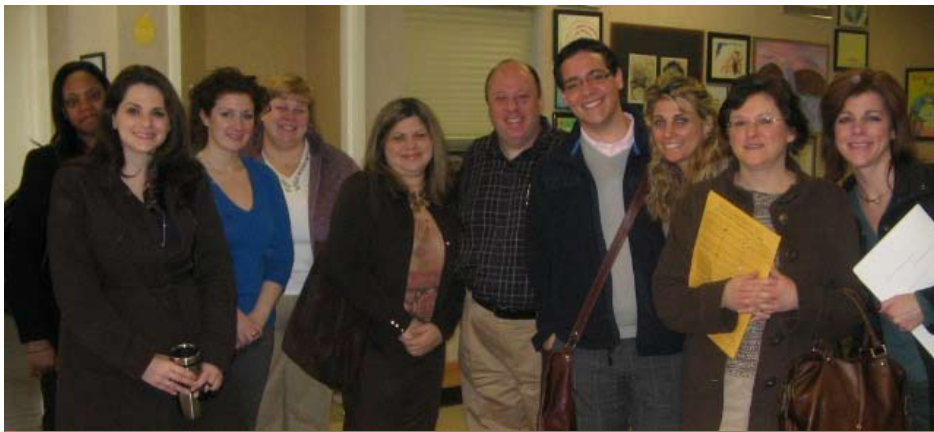
The Bed Bath & Beyond is excited to see the wonderful things going on at the Head Injury Association.

Survivors at Clubhouse and Bridges Day Programs were visited by an enthusiastic group of employees from Bed Bath & Beyond. The Bed Bath & Beyond team continues to provide annual support through fundraising and solicitation. Much of their solicitation results in special items that enrich the lives of TBI survivors residing in our Group Homes and Day Programs.